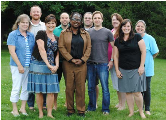
Family Portrait: A graduated Sister in Cleveland, OH and her Table.

Each Table is hosted by a congregation (up to three congregations may share a Table). A required team of volunteers (10-12 people help an adult or family and 6-7 help a young adult transitioning out of foster care or a veteran) serve over an 8 – 12 month period. Tables generally meet once a week and often at a lesser intensity as the work progresses. Table members are primarily generalists, work as teams and also provide leadership for important life domains (see Open Table model diagram). A national team of volunteer Open Table Coaches train a volunteer Congregation Coordinator in each faith community to lead the model and launch Tables.